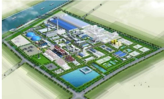
Executives from Shihlien China Holding Co and Haver & Boecker agree the contract and (right) how the chemical industrial park will look on completion