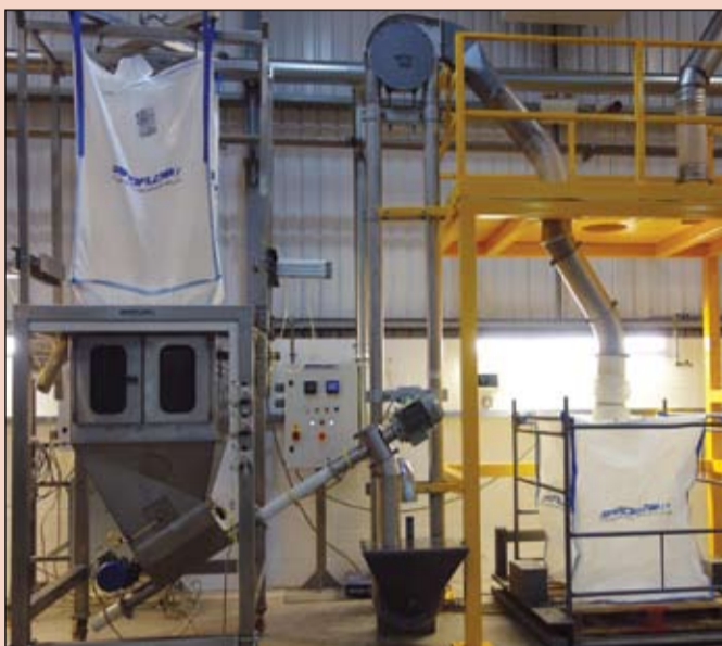
At the Spiroflow Technology Centre one of the company's bulk bag dischargers is pictured feeding material into a flexible screw which transfers it to an aero-mechanical conveyor which then feeds it to another bag.