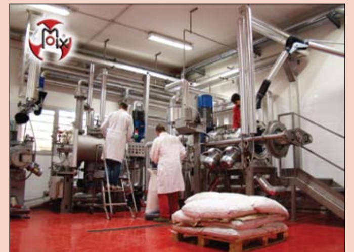
Blending tests being carried out at Mix's Cavezzo test plant.