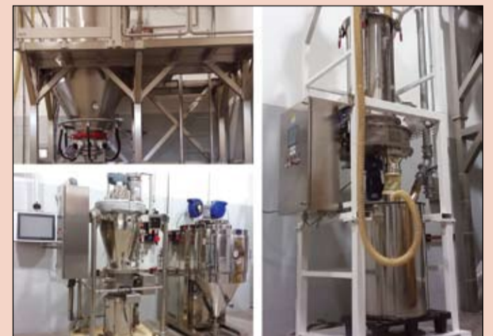
Pneumatic blender, spray dryer, Ribocone and Circle Feeder at Nol-Tec Europe's research centre.