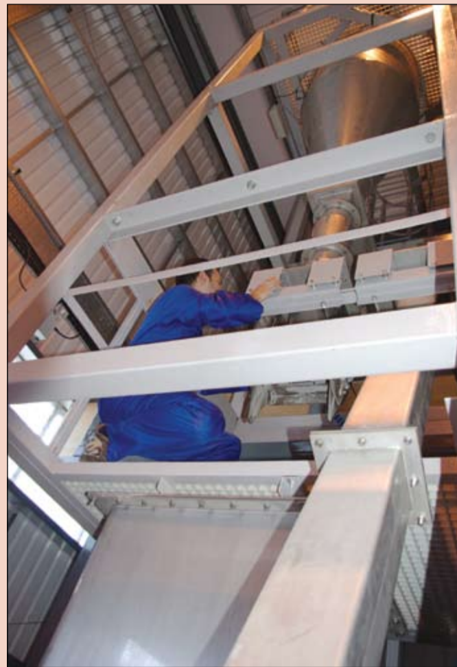
Pilot processing plant at the Wolfson Centre.