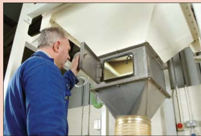
Client tests being undertaken at the UniTrak Powderflight test plant.