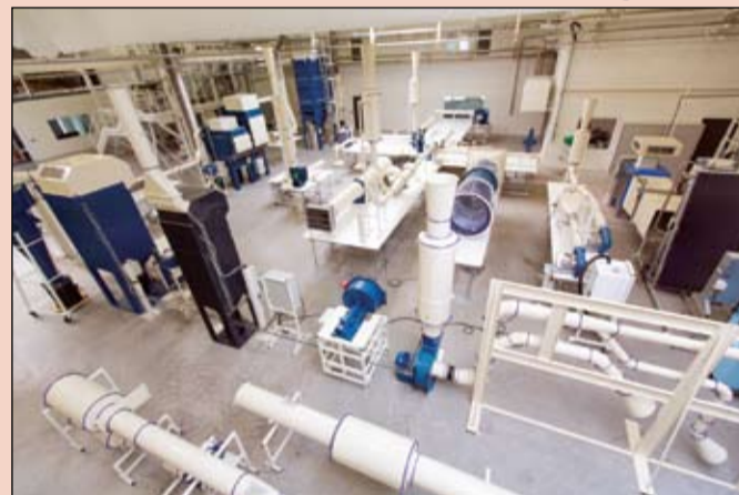
Part of the extensive NEU Air Processing and Testing Centre in northern France.