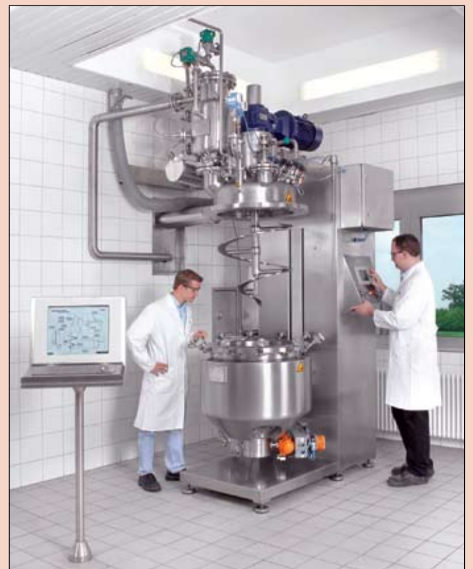
A mixer trial underway at the Schopfheim test centre of EKATO SYSTEMS.