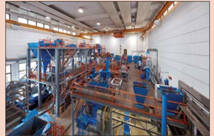
Köppern Pilot Plant operates in cooperation with the technical university Bergakademie Freiberg.