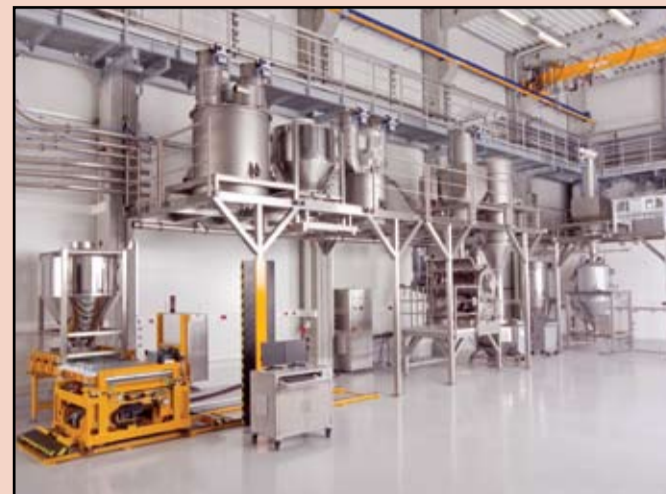
Part of Zeppelin's Food Technology Center in Rödermark, Germany.