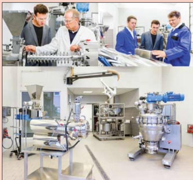
Different aspects of the AVA Test Centre.

Classical as well as alternative preparation procedures and solutions are practically demonstrated to the customer at the Eirich test centres after that, in order to enable the