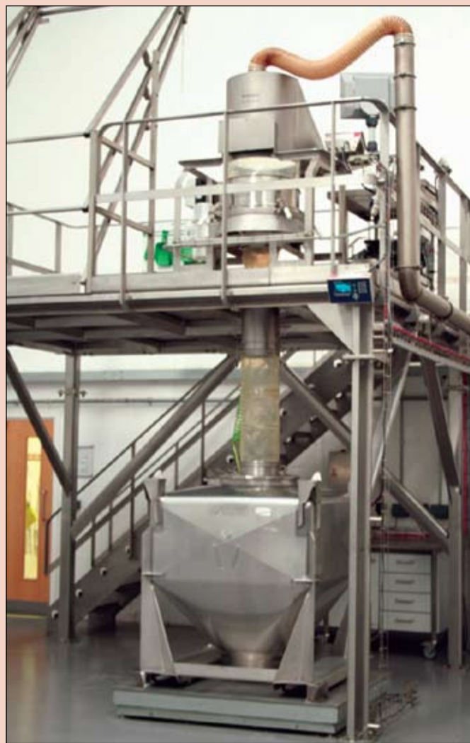
View of sack tip module inside Matcon's UK test plant, which provides a closed transfer of material from sack to IBC.

What is available: The state-of-the-art test plants are equipped with full-scale materials handling equipment to provide accurately simulated working