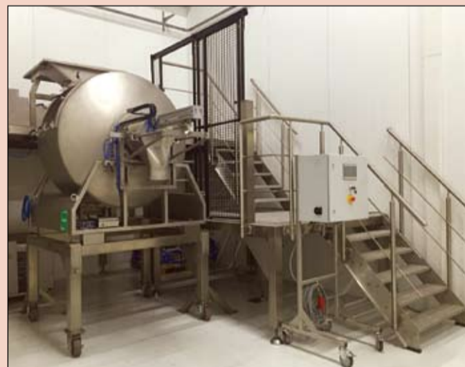
Part of Lindor's Dordrecht test plant.