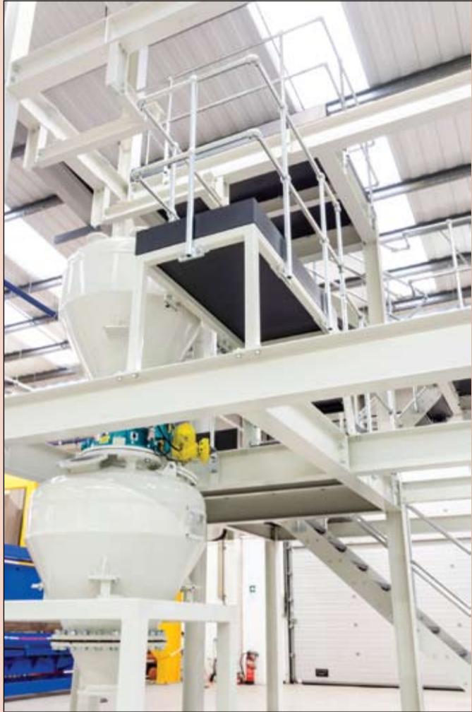
Part of the pneumatic conveying test rig at FPE Global's new Manchester test facility.