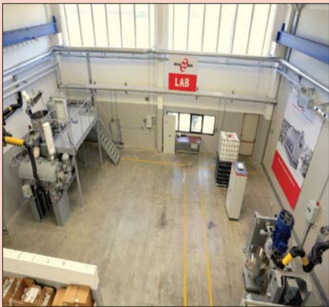
PROMIXON's Magnago test facility.