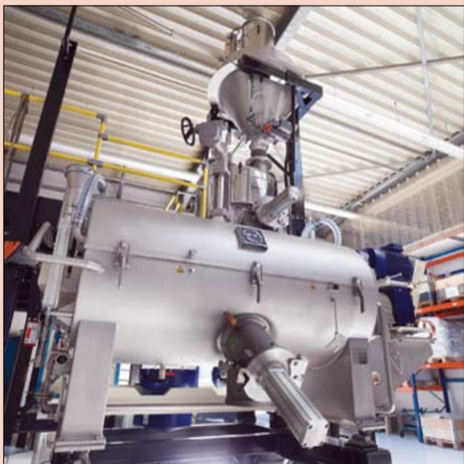
MTI's R&D centre – completely refitted in 2015.