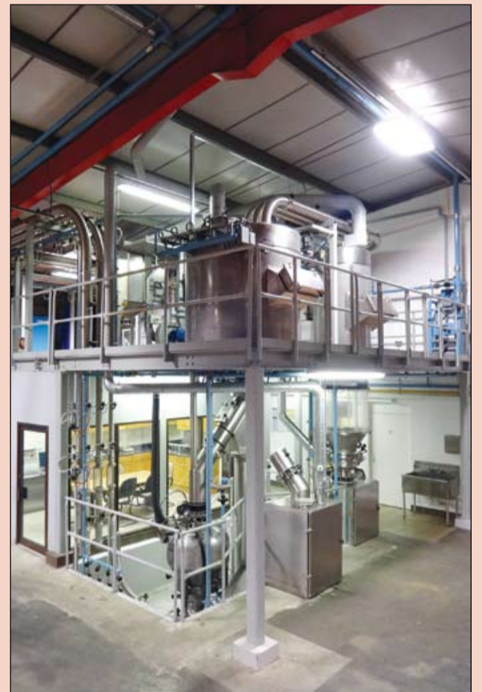
Dynamic Air's Milton Keynes, UK, test plant is especially well equipped for pneumatic conveying trials and serves a Europe-wide customer base.

What is available: At the Eirich Process Technology Center in Hardheim, the activities of the Eirich Group are combined in research, development and