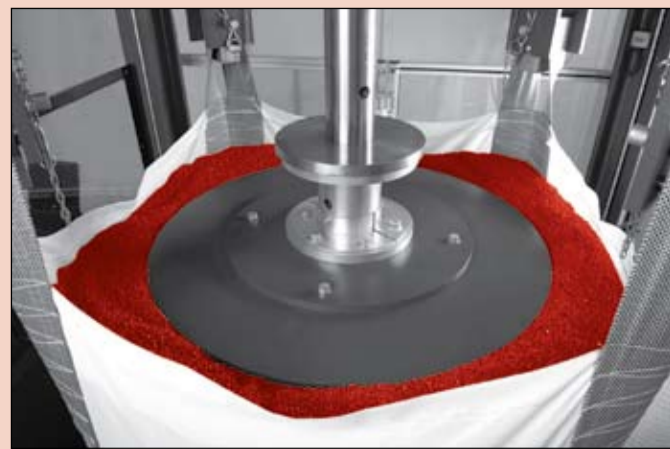
Top lift test of a four-point FIBC on the stacoTEST FIBC test rig in the Starlinger testing facility in Weissenbach, Austria.