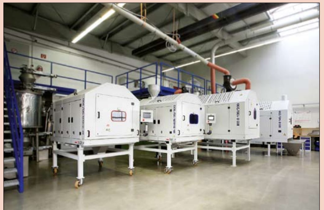
The main trial centre in Senden of KREYENBORG Plant Technology.