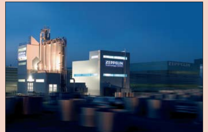
Zeppelin's Friedrichshafen test centre by night; here at least one world first in pneumatic conveying technology is reported to have been pioneered.