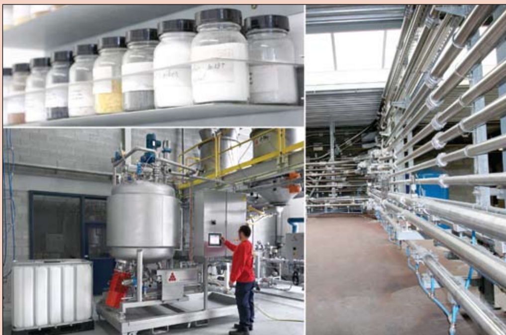
J-Tec's test facility has up to 450m of conveying lines and offers state-of-the-art process technology for its customers worldwide.

Terms of use: Available to existing customers and