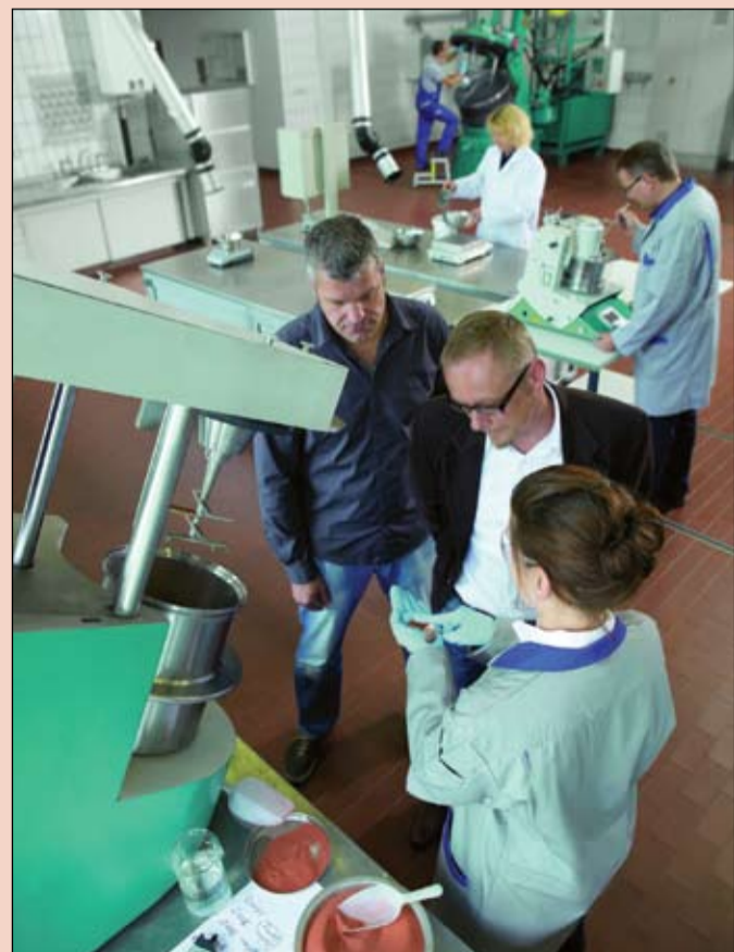
Inside the Eirich Process Technology Center in Hardheim.